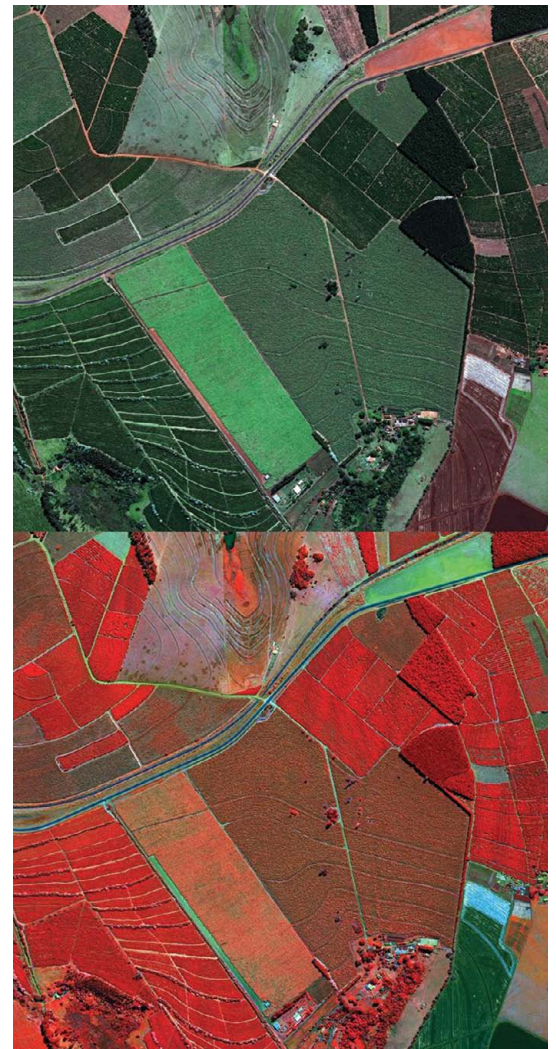
Near Sao Paulo, Brazil Collected August 26, 2010