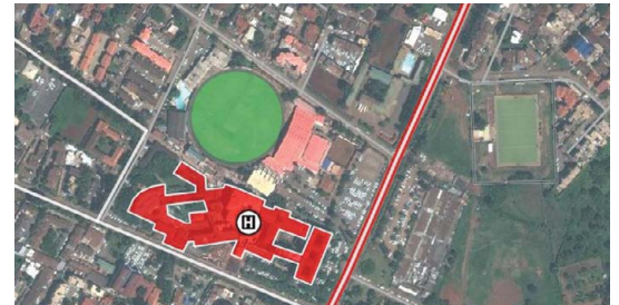
Integration: Feature information is overlaid on updated high-resolution imagery

Authorized users securely connect using the CACI Freedom Web® platform to organize their response and collaborate among teams.