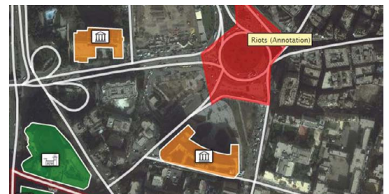
Collaboration: Up-to-date information is added by and shared among authorized users